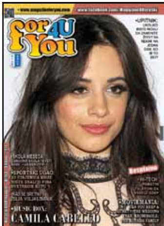
Naslovna: Camila CABELLO

For You je službena publikacija KFOR-a, proizvedena i finansirana od strane KFOR-a. Štampa se na Kosovu i distribuira besplatno. Sadržaj magazina ne odražava uvek stavove koalicije ili bilo koje zemlje članice pojedinačno. KFOR prihvati i traži vaša mišljenja, neka od njih će i objavljivati, verovatno u skraćenoj formi. Ako autor pisma tako želi, njegovo/njeno ime neće biti objavljeno. KFOR neće objavljivati anonimna, maliciozna ili klevetnička pisma.