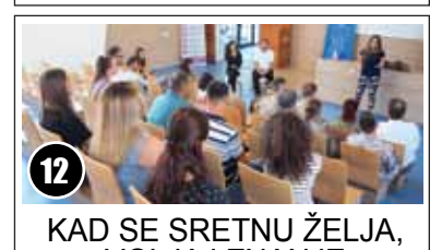
KAD SE SRETNU ŽELJA, VOLJA I ZNANJE