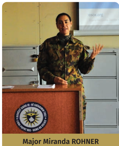
Major Miranda ROHNER

Na kraju dodajmo da je saradnja između KFOR-a, OEBS-a, EULEX-a i KP-a od vitalnog značaja u sprečavanju i suočavanju sa nasiljem u porodici. Njihov zajednički cilj je smanjivanje i sprečavanje svih oblika porodičnog nasilja, kao i obezbeđivanje policijske podrške za žrtve i svedoke rodno zasnovanog nasilja i porodičnog nasilja.